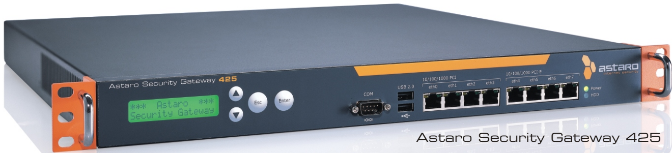
Astaro Security Gateway 425