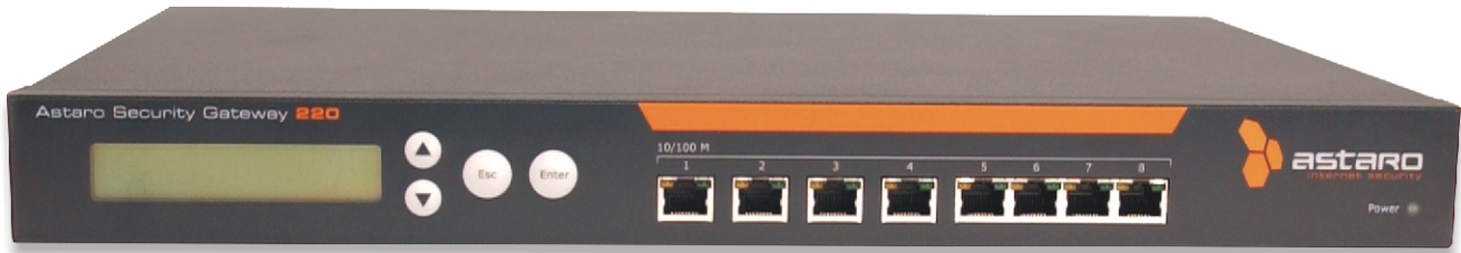
Astaro Security Gateway 220